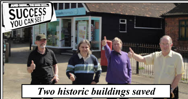
Two historic buildings saved