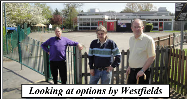
Looking at options by Westfields