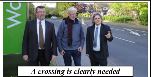
A crossing is clearly needed

Taking action on the issues that matter!