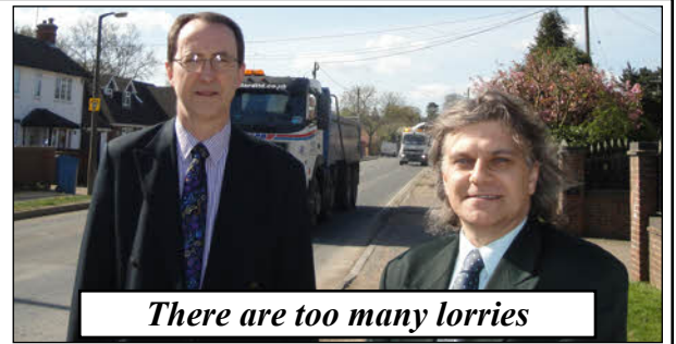
There are too many lorries

Campaigning to make life better for us all!