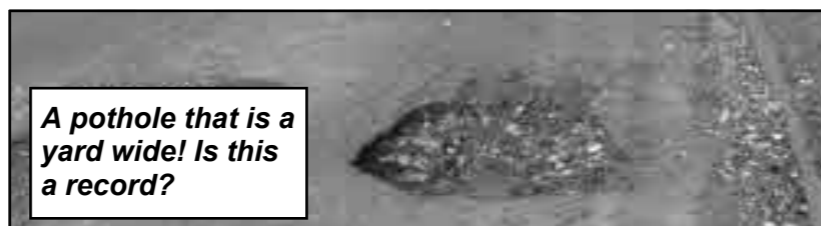
A pothole that is a yard wide! Is this a record?